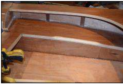
The whitewood strip is glued in place and the crew seats have been faired off with an angled cut out to mount the jib cleat tracks on